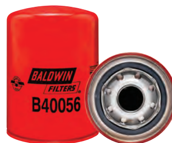
B40056 vs DOOSAN 23279078

UPC: 7 91440 10784 7 Case Quantity: 12 Case Weight: 16.1 lbs. (7,3 kgs.) Filter Weight: 1.3 lbs. ea. (0,608 kgs. ea.) Volume: 0.050 ft³ ea. (0,001 m³ ea.)